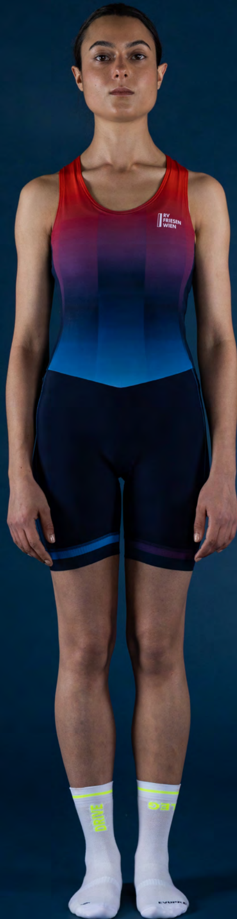
Cover outfit: Florian wearing the Long Sleeve Racing Top, Vest, Long Tights, Socks and Visor. Lucia wearing the Women's Racer with V-Shape sewing, ECO-fabrics, 100% customizable, Socks.